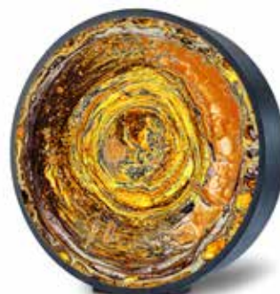
Light box sculpture edition series - 7-40 Mixed media on tempered glass, metal, LED 80x80x20 cm